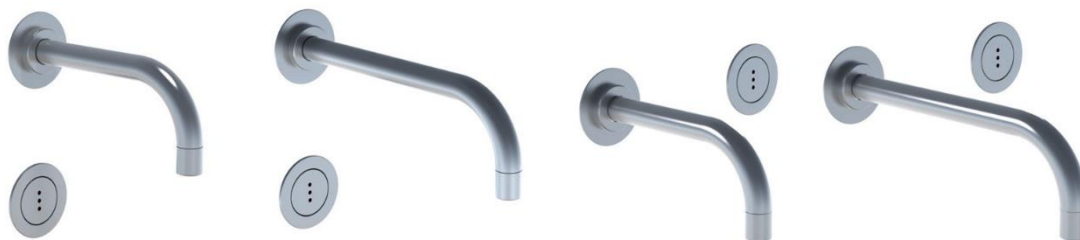
Figure 1: 4311, 4321, 4811, 4821