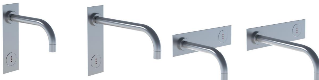
Figure 2: 4312, 4322, 4812, 4822

Eight products (4311, 4321, 4811, 4821, 4312, 4322, 4812, 4822) are calculated in six different surfaces (16 and 20, 19, 40, 27, 60, 64) and twelve product groups, see Figure 1 and Figure 2.